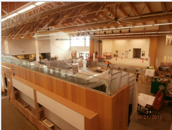
Commons with Stage