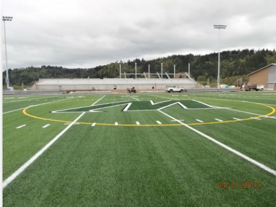
Grandstands and new synthetic turf field