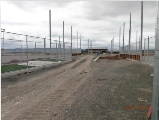
Spectator areas at baseball and softball fields