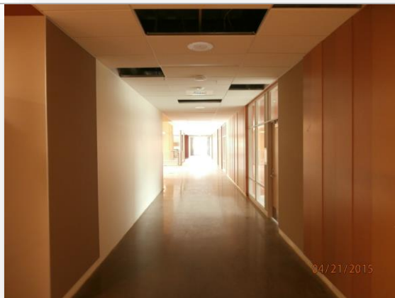
South Wing Concourse