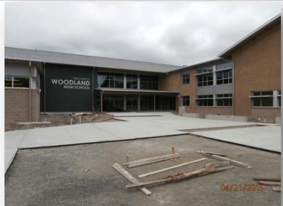
Main Entry and Administration