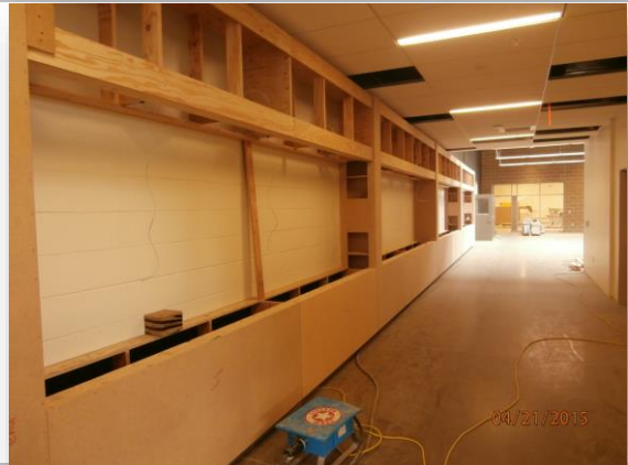
Trophy Cases at Gym Lobby