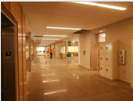
Upper Main Concourse