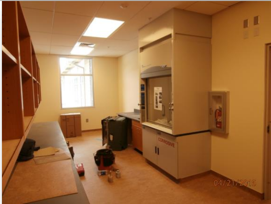
Science Prep Room