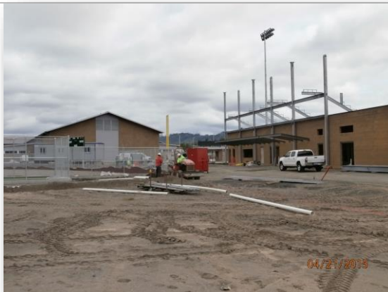
Back of Grandstands (concessions and restrooms)