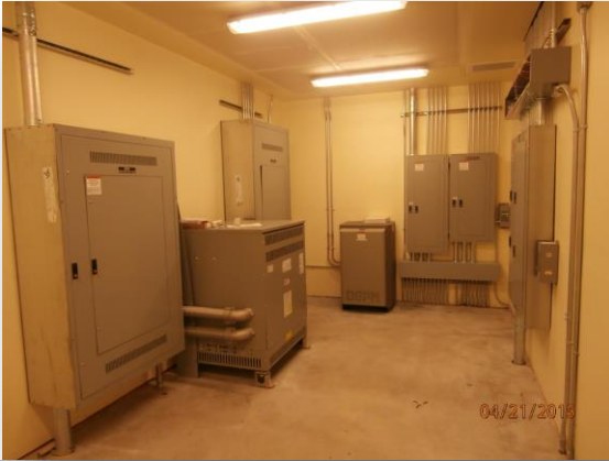
Typical Sub-Electrical Room