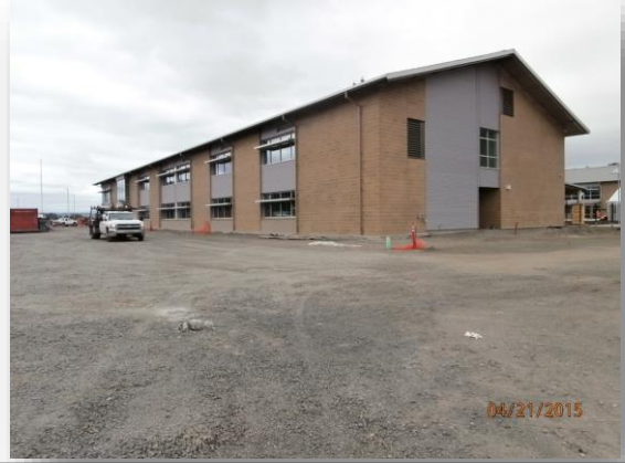
South Classroom Wing