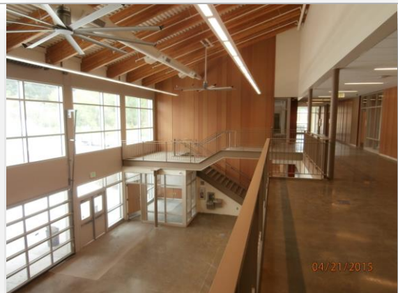
South Shared Activity Area