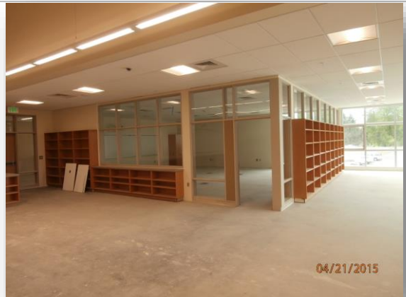
Computer Lab in Library