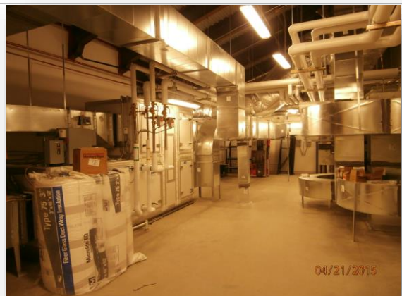
Typical Mechanical Room