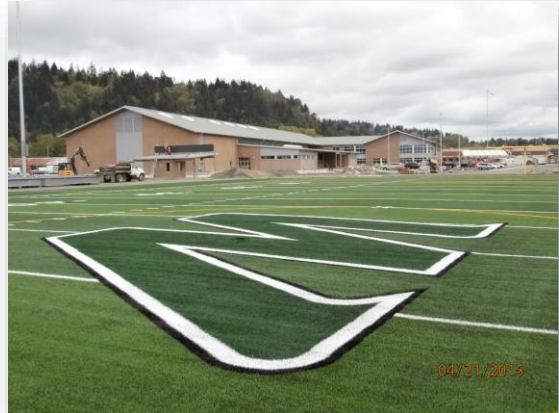
Football field and school beyond