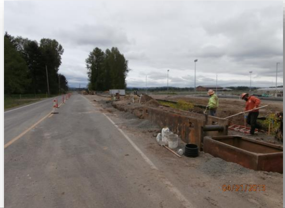
Dike Access Road Improvements