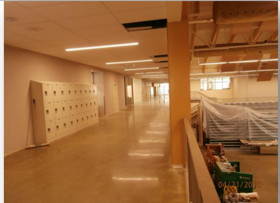
Upper Main Concourse