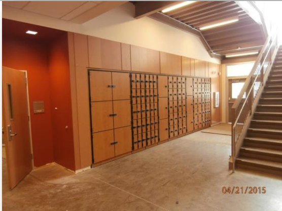
Musical Instrument lockers