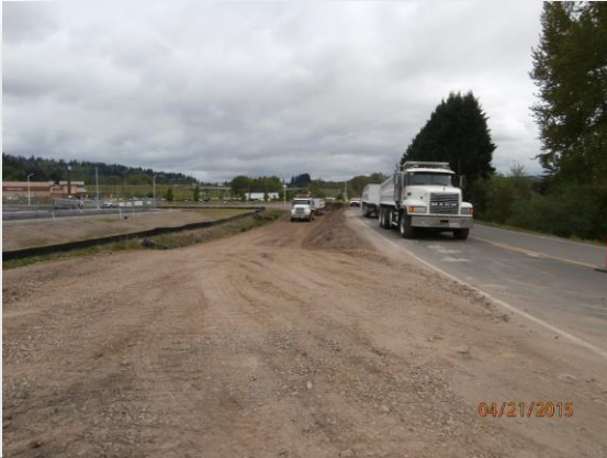
Dike Access Road Improvements