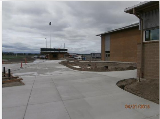
Ticket Booth and sidewalk to Stadium