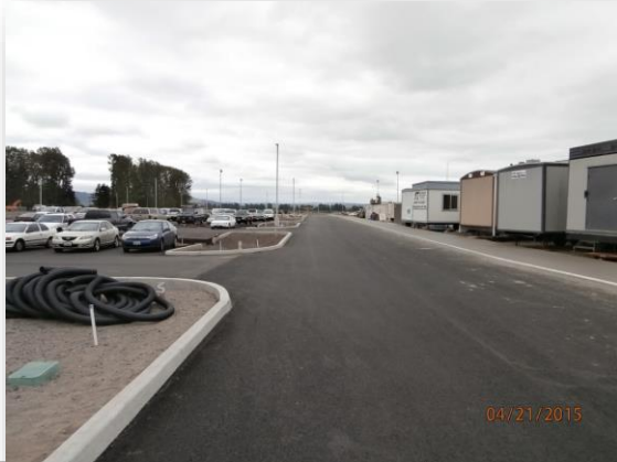
Vehicle entry form Robinson Road