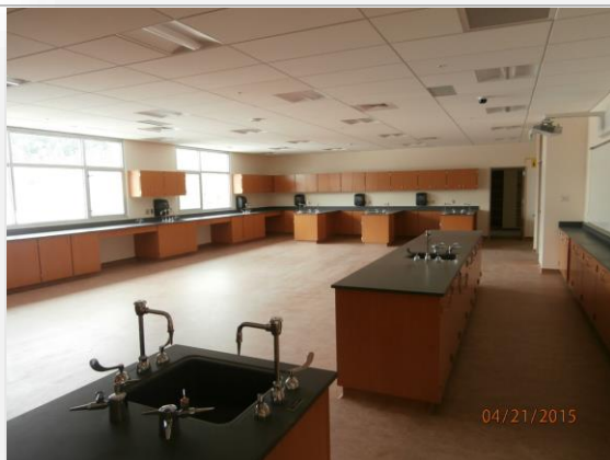
Typical Science Classroom