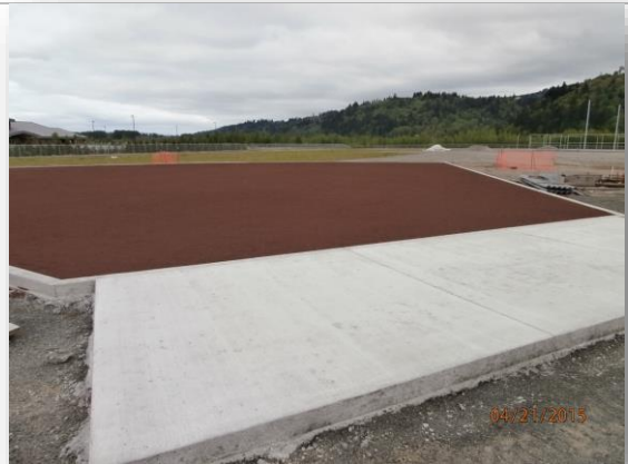
Shot put and discus areas