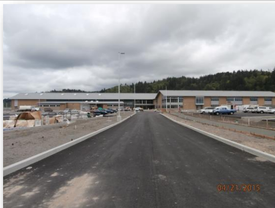
View from main vehicle entry

Additional photos available via web camera access: www.dwpwebcams.com/whs/desktop.htm