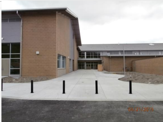
Student Entry on north side