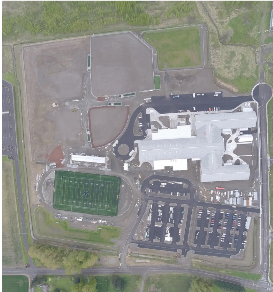
Aerial view 04.07.2014